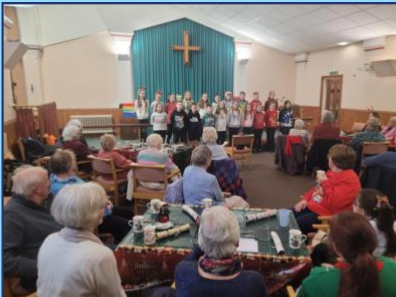
Yr6 Choir singing at East Bridgford Care Group.

Our Pupil Parliament had an idea to sing in our community.