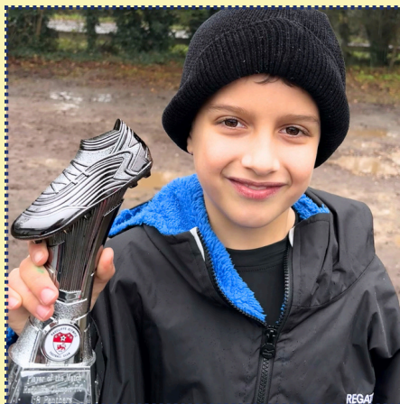
Player of the Match for Reis at the weekend! So proud of you ♥