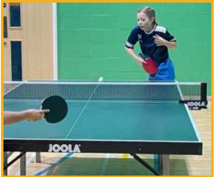
Although our team cannot proceed to the final, it was an epic performance. Well done girls! They