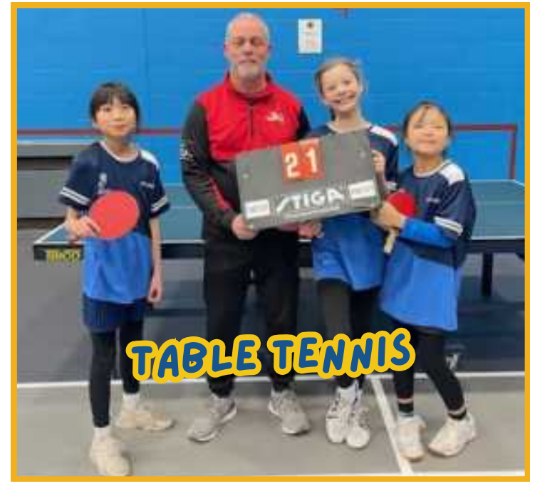
Our girls won! They are brilliant! Congratulations to East Bridgford St Peter's CE Academy Girls winning the area semi-finals.