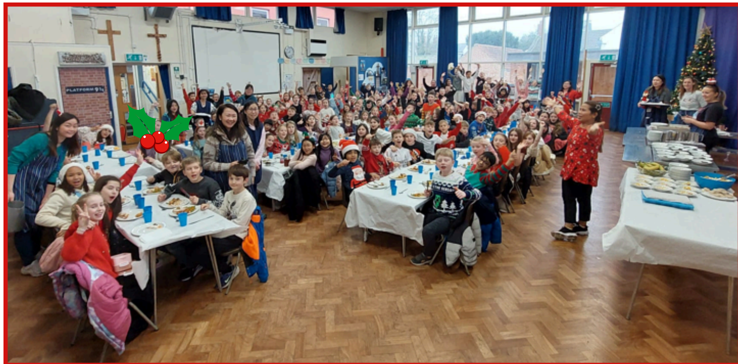
227 CHRISTMAS DINNERS AND CHRISTMAS PUDDING WITH CUSTARD AND A MINCE PIE!