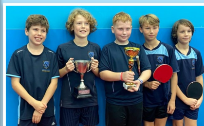
Table Tennis Competition