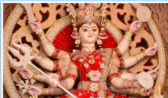
The goddess Durga was given weapons to take on the demon, Mahishasura

Navratri is one of the most important festivals in the Hindu calendar. It's celebrated all over the world, typically falling between September and October during the month of Ashvin, and lasts for nine days. Nav means nine and Ratri means nights. People come together during Navratri to celebrate Durga, the mother goddess who carries lots of weapons in her arms. Durga is best known for killing an evil demon in a battle which lasted nine days and nights and that is why the festival lasts for nine days and nights as well! Each day is represented by a different colour which symbolises one of her distinct characteristics or traits. Many Hindus wear a different coloured traditional outfit each day to reflect this. The festival ends with what's known as Dussehra, which is the celebration of good over evil.