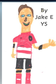
By Jake E Y5