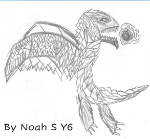
By Noah S Y6