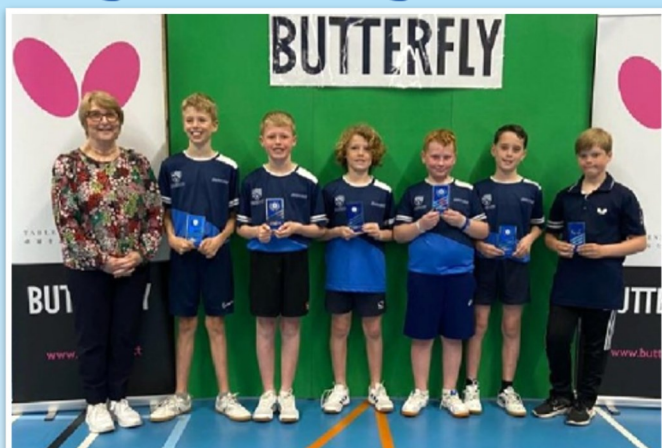
Table Tennis National recognition. Congratulations!