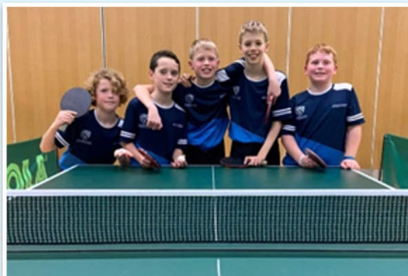
Table Tennis Champions