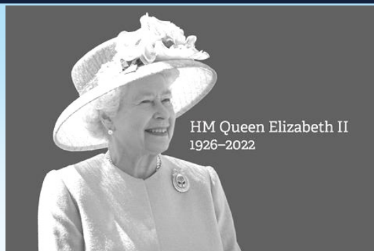
HM Queen Elizabeth II 1926-2022