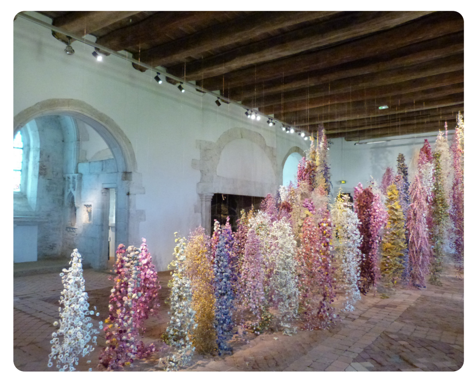
Banquet by Rebecca Louise Law, 2019

Some land artists bring materials inside from the outdoor environment to create installations in galleries and exhibition spaces.