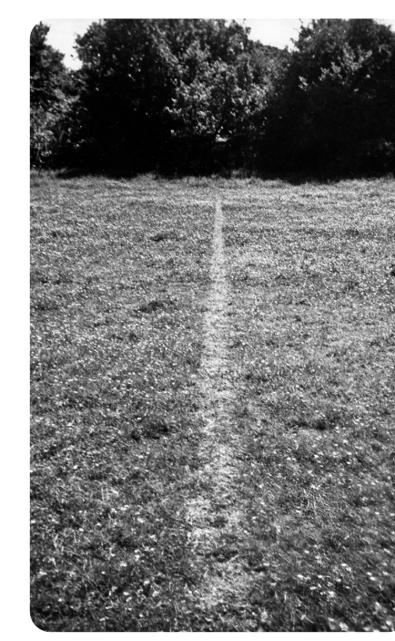
A Line Made by Walking by Richard Long, 1967

Land art can be made from many materials. Some artists sculpt the land into pieces called earthworks. Other artists use natural materials, such as twigs and rocks, to make sculptures within the landscape. Land art may be temporary, such as A Line Made by Walking. Richard Long made this line in the grass by repeatedly walking backwards and forwards.