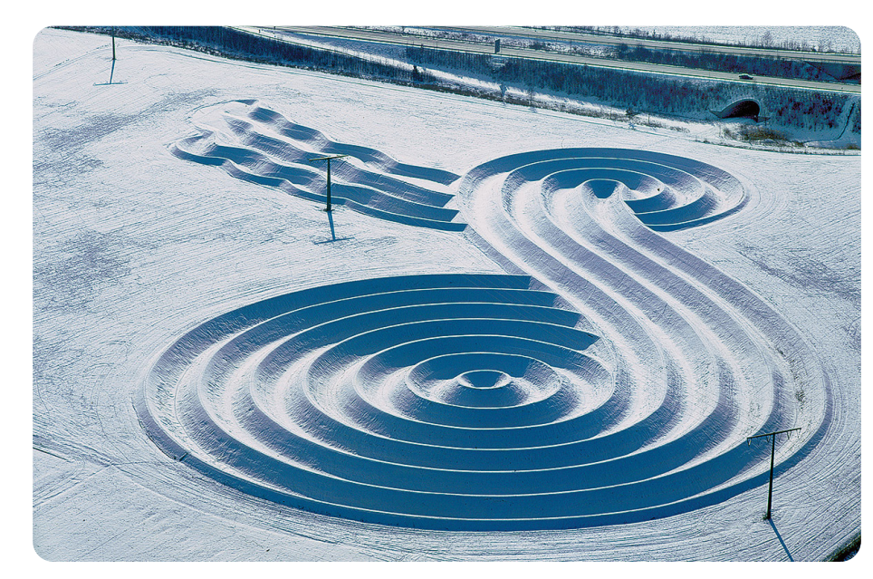
Earth Sign by Wilhelm Holderied, 1995

A relief sculpture projects from a flat surface. A high relief sculpture clearly projects out of the surface and looks like it is freestanding. A low relief, or bas-relief, sculpture does not project far out of the surface and is visibly attached to the background.