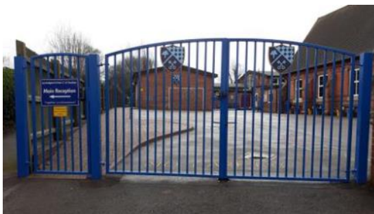
Entry via the playground gates