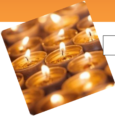
Sparkle and Shine