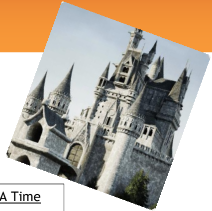
Once Upon A Time

Sparkle and Shine teaches children about the celebrations that take place during the autumn and winter seasons and focus on the significance and symbolism of light at this time of year.